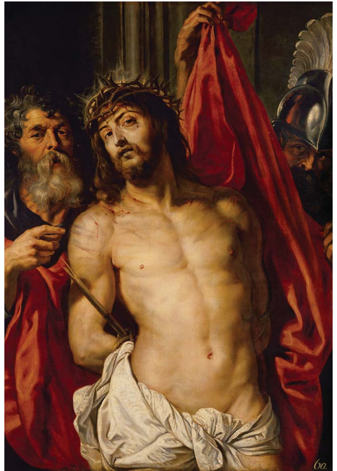
Peter Paul Rubens, Ecce Homo , c. 1612. State Hermitage Museum, St. Petersburg

Exhibited in Peter Paul Rubens: The Power of Transformation . Kunsthistorisches Museum, Vienna, October 17, 2017 – January 21, 2018