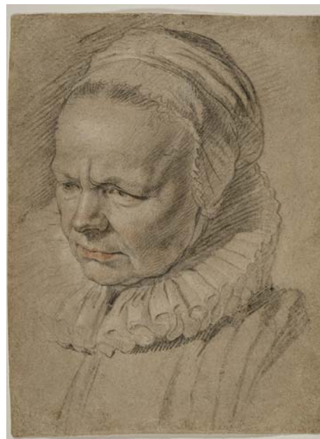
Jacob Jordaens, Portrait of Elizabeth van Noort, the Artist's Mother-in-Law , c. 1630s; black, red, and white chalks on buff "oatmeal" paper, 12-3/8 x 9-5/8 in. Ackland Art Museum, The University of North Carolina at Chapel Hill, The Peck Collection.