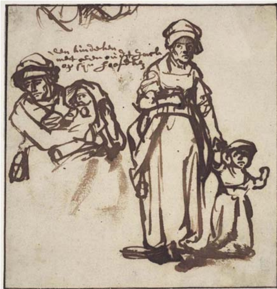
Rembrandt van Rijn, Studies of a Woman and Two Children , c. 1640; reed pen and finger rubbing in dark brown (iron gall) ink, 5-3/8 x 5-13/64 in. Ackland Art Museum, The University of North Carolina at Chapel Hill, The Peck Collection.