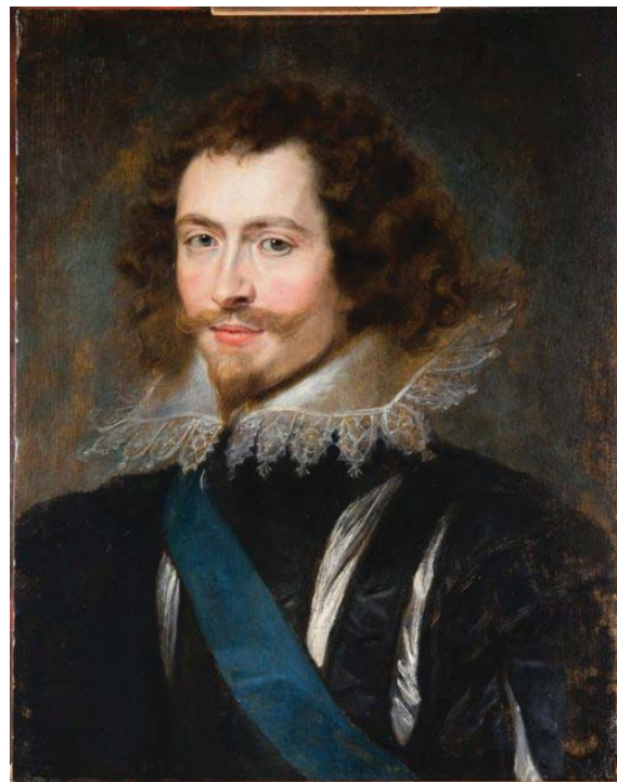
Peter Paul Rubens, Portrait of George Villiers, 1 st Duke of Buckingham, c. 1625. Glasgow Museums.