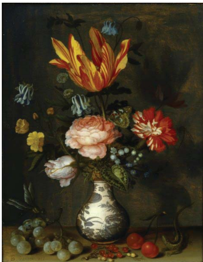
Balthasar van der Ast (1593-1657), Flowers in a Wanli Vase , Suermondt-Ludwig-Museum, Aachen

A long-lost still life by Balthasar van der Ast has been returned to the Suermondt-Ludwig-Museum on July 10, 2017.